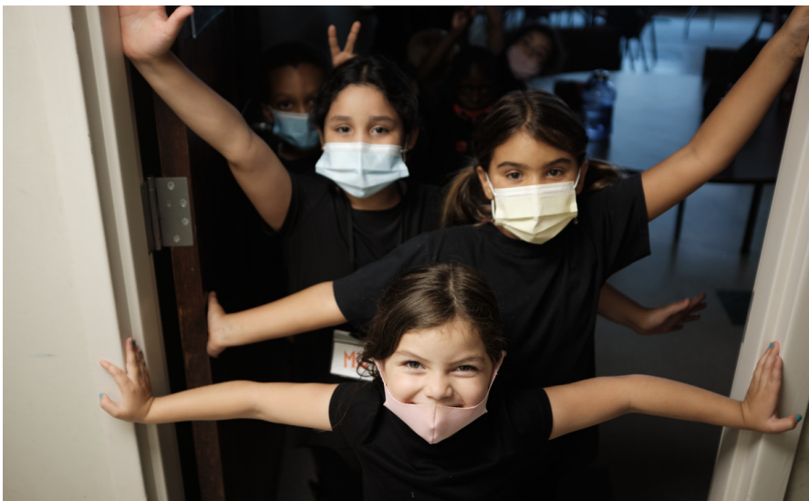
SUMMER ARTS CAMP 2021

As we continue into 2022, we have hired a new Classroom Teacher, have expanded our program to include new students, are preparing for our annual Cultural Celebration Fundraiser, and getting ready for this year's Summer Arts Camp.